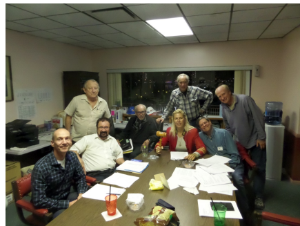
A final photo of some of our 2015 board Members