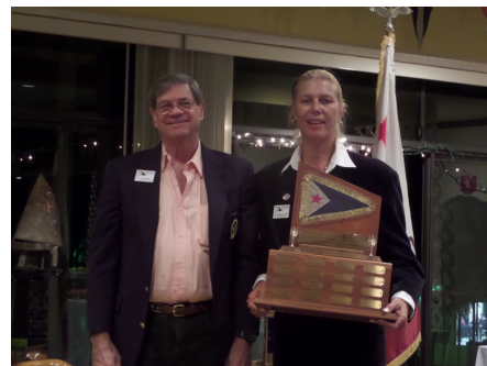
Here I am receiving the very coveted "Burgee of Merit" from the Board of Directors in our much celebrated Awards night.