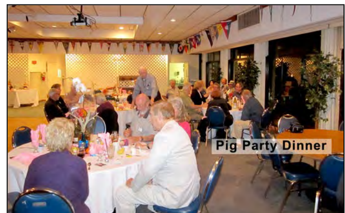
Pig Party Dinner