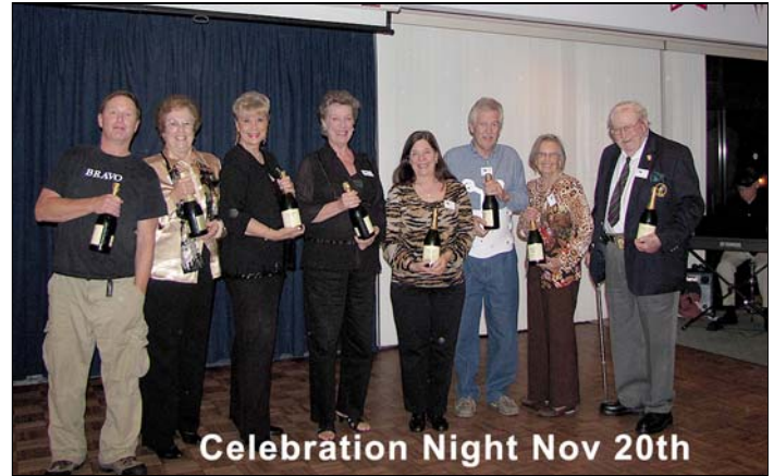
Celebration Night Nov 20th