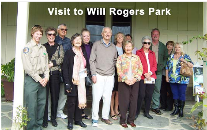
Photos of Will Rogers Home visit

Please join us at our June 1st meeting at 6:00 p.m. at the Club. We'll be discussing our Design Project progress, future events and we'll enjoy our wine and appetizers. I'm looking forward to seeing everybody.